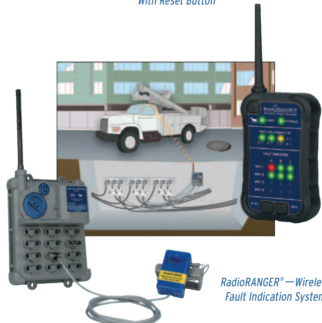
RadioRANGER®—Wireless Fault Indication System