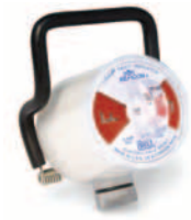
BER—BEACON Electrostatic Reset