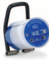
BTRIP—BEACON® Field-Programmable Timed Reset