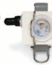
MB—Manual Reset With Reset Button