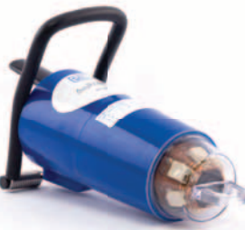
AR 360—360° Overhead AutoRANGER®