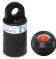
TPR—Test Point Reset