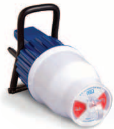
WS—Wireless Overhead Sensor