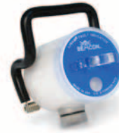
BTRI_IR—BEACON Timed Reset