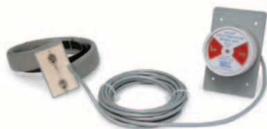
GFD—Ground Fault Detector