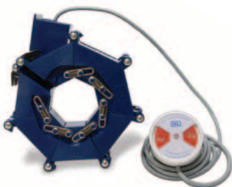
PILC—Paper-Insulated Lead Cable Fault Indicator